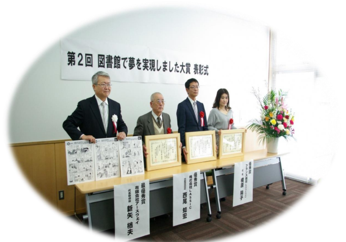
The-Library-Helped-My-Dream-Come-True Prize Award Ceremony 2015